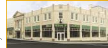
First Federal's renovated headquarters at the Detroit Avenue/Warren Road intersection in Lakewood.

First Federal, a downtown Lakewood mainstay for 69 years, has invested more than $2 million into its corporate headquarters, 14806 Detroit Ave., positioning itself for future growth on the interior, while revitalizing the exterior of five buildings between Cook Avenue and Warren Road.