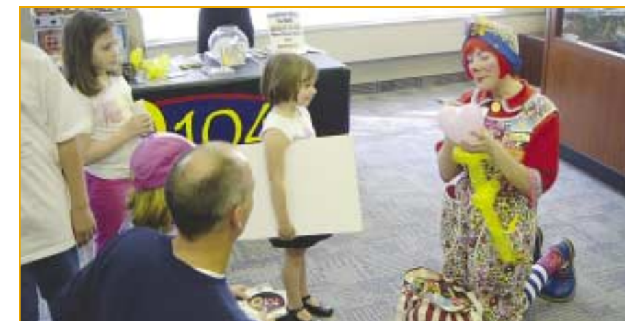
Skipper the Clown entertains First Federal customers during the April 24 open house.

Fact: The Marshall building interior renovations have expanded First Federal's headquarters from 39,807 square feet to 54,958 square feet.